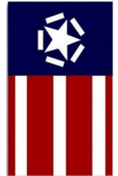
Vertical: Star Points Right

This protocol for displaying the Freedom Flag has been prepared to provide uniform institutional guidance to schools, fire stations, and government buildings, along with the general public on when and how to fly the Freedom Flag. In preparing this protocol, the Freedom Flag Foundation seeks to respect fully the existing protocols for flying the US Flag, all state flags, and other official flags. The Freedom Flag Foundation oversees distribution of Freedom Flags and welcomes any questions or suggestions related to this protocol at office@freedomflagfoundation.org .