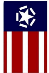
Vertical: Star Points Right

This protocol for displaying the Freedom Flag has been prepared to provide uniform institutional guidance to schools, fire stations, and government buildings, along with the general public on when and how to fly the Freedom Flag. In preparing this protocol, the Freedom Flag Foundation seeks to respect fully the existing protocols for flying the US Flag, all state flags, and other official flags. The Freedom Flag Foundation oversees distribution of Freedom Flags and welcomes any questions or suggestions related to this protocol at office@freedomflagfoundation.org .