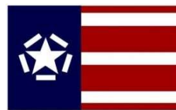
Horizontal: Star Points Up